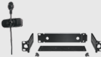
ew 322 ES

Presentation Set with ME 4 clip-on microphone