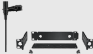
ew 312 ES

Presentation Set with ME 2 clip-on microphone