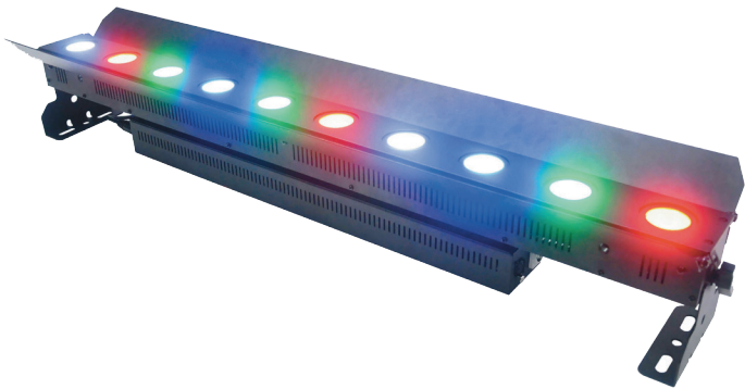
Barndoor optional accessory

The SL eSTRIP 10 is the latest addition to the Showline eSeries family. Ten cells of homogenized RGBW LEDs deliver a blended wash of colour, emulating the traditional halogen strip light effect, with reduced power consumption, lower heat output, and minimal maintenance.